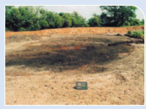
Burnt spread from exposed fulacht fiadh uncovered at Muckridge.

Three fulachta fiadh were uncovered along the route. One particularly early example from Muckridge has been dated to the transitional period between the Late Neolithic and the Early Bronze Age period (c. 2620 BC-2280 BC). This site was located to the west of the Blackwater River and just north of Youghal town. The excavation revealed two large timber-lined troughs in association with an apparently random array of stake-holes. Another example from Clashadunna East, dated to 1130-1030 BC, revealed three circular stake-holes cut into the base of the trough. A single fragment of flint was recovered from this site. Another fulacht fiadh, dated to 940-860 BC, was excavated in the townland of Propoge. This consisted of a thin spread of burnt stone material and an unlined circular trough.