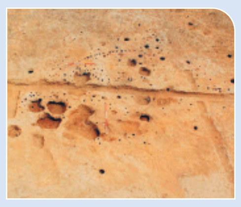
Dense cluster of Bronze Age settlement features uncovered at Ballyvergan West after excavation.

A cluster of Bronze Age activity was uncovered at Ballyvergan West, nestled between the River Blackwater and Womanagh River, 2km to the east of Youghal town. The main area of activity centred on an unenclosed area measuring 10m x 10m, which contained a large number of pits, stake-holes and post-holes. These features represented the remains of several timber-built structures (including at least one oval house structure), fence lines and a possible lean-to structure. These secondary structures are thought to have been used as animal huts with a surrounding post-and-wattle fence. The post and stake-holes were found in association with a high concentration of hearths and large refuse pits, which