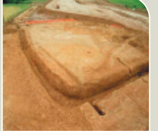
View of northern extension to early medieval enclosure uncovered at Ballynacarriga. (Photo A.C.S. Ltd.)

Corn-drying kiln revealed during the excavation of an early medieval enclosure at Ballynacarriga. (Photo A.C.S. Ltd.)